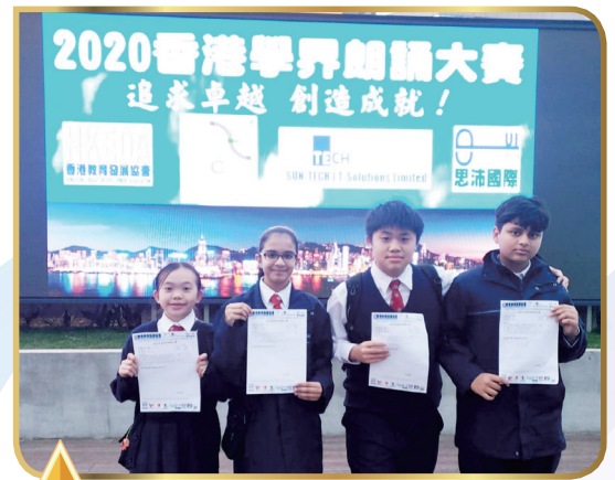
Hong Kong Schools Speech Competition

Apart from the Hong Kong Schools Speech Festival, a few of our students took part in the English Speech Competition organized by the Hong Kong Education Development Association. The results were outstanding: Champion, First Runner-up and Second Runner-up. Our students widened their horizons and enlarged their social circles when they met other contestants from other schools.