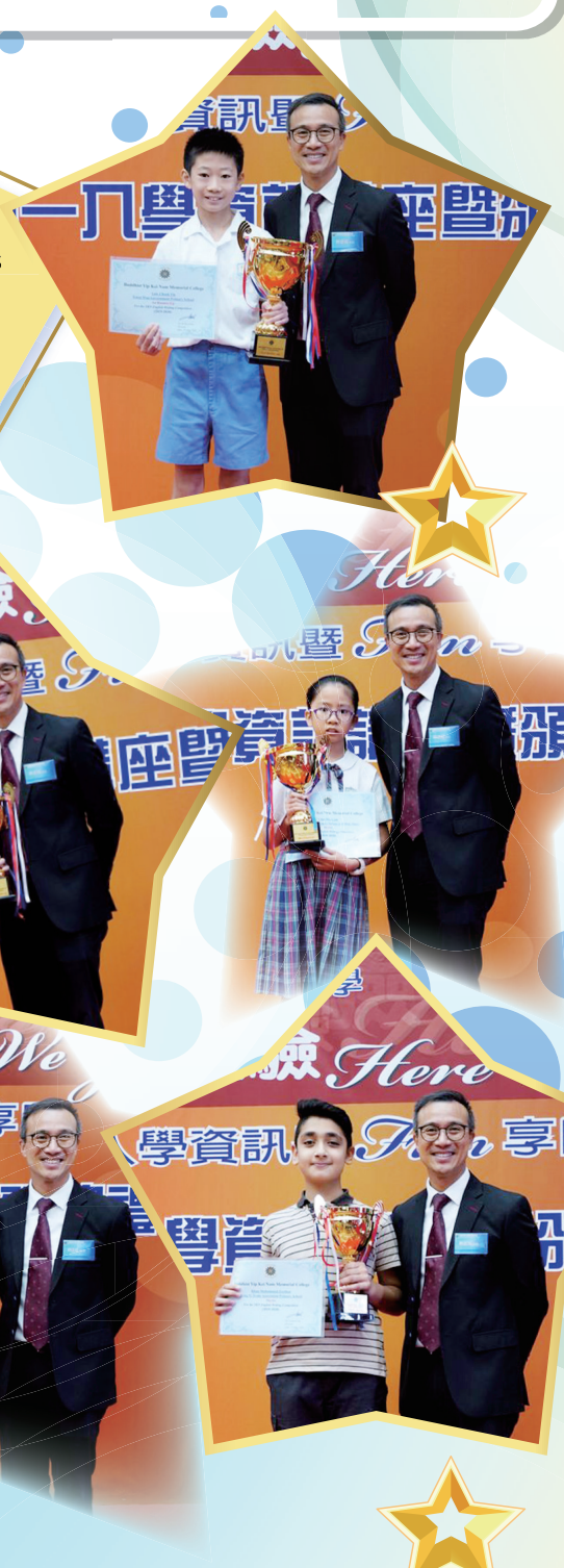
YKN English Writing Competition for Primary School Students